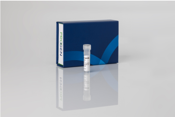
AAV8 empty capsids

SDS PAGE with AAV8 empty capsids. The AAV8 VP1, VP2 and VP3 proteins were separated on a 10% SDS PAGE and visualized by Pierce Silver stain kit (Cat. No. 24612). Only VP1, VP2 and VP3 proteins in the correct stoichiometry of 1:1:10 are detectable indicating a purity of the AAV preparation of > 95%.