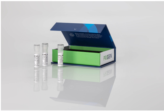
AAV2 VP2, recombinant protein