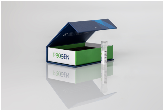
anti-Cyclin D3 mouse monoclonal, DCS-22, lyophilized, purified

IHC analysis of human endocrine epithelial cells of the islets of Langerhans of the pancreas using anti-Cyclin D3 antibody (Cat. No. 61064). IHC was performed on formalin fixed paraffin embedded sections. The samples were deparaffinized with xylol and ethanol followed by heat induced antigen retrieval with 10 mM citrate buffer. After preparation the tissue was blocked with normal serum for 20 min at RT. The primary antibody anti-Cyclin D3 (Cat. No. 61064) was diluted in PBS (antibody concentration 2.5 µg/ml) and incubated at 4°C over-night. The secondary antibody ImmPRESS HRP anti-mouse IgG was incubated for 20 min at RT. Slides were incubated with DAB solution until a brown staining is visible and with Haemalaun for a few minutes. The 10x picture was acquired using microscopy.