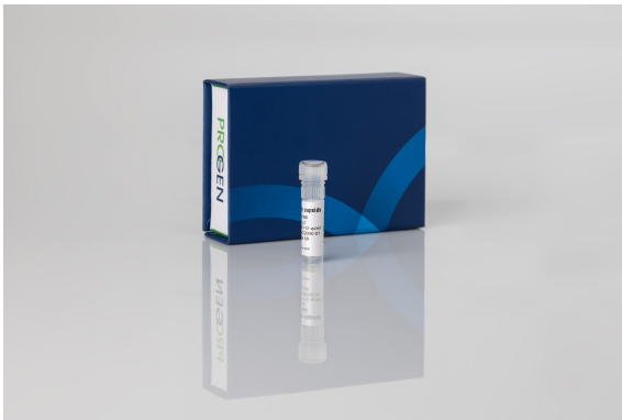
AAV5 standard material (eGFP)