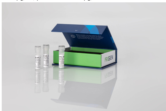
AAV2 VP3, recombinant protein

Pipetting scheme for western blot analysis using a mix of the AAV2 capsid proteins (Cat. No. 640823, 640824, 640825). To create a VP mixture with the molar ratio 1:1:10 (VP1:VP2:VP3), please pre-dilute VP1 and VP2 1:10 to yield a final concentration of 10 µg/ml (green table). Pipette the pre-diluted VP1 and VP2 proteins and mix them with the undiluted VP3 protein in your sample buffer and water (blue table). The example with 2x and 3x sample buffer and the required volumes are indicated in the pipetting scheme. Thus, in one lane, 10 µl of the VP mix can be loaded onto the SDS PAGE and analyzed by Western blot using the B1 antibody (Cat. No. 690058, Cat. No. 61058-488, Cat. No. 61058-647). Undiluted = 100 µg/ml, pre-diluted = 10 µg/ml